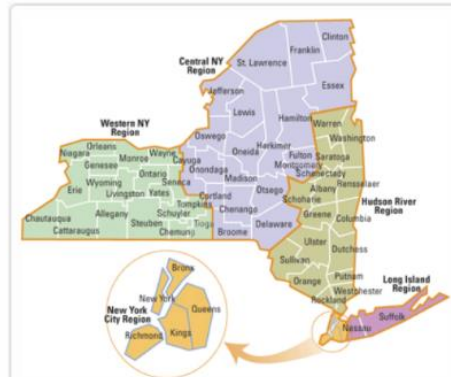
OMH Regional Map

Report what’s happening in your area! Send news and announcements for the Virtual Community website and Virtual Community News Digest. Send email to academy.virtual.community@gmail.com